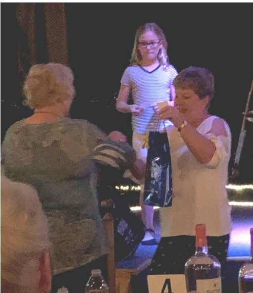
Door prizes, too!